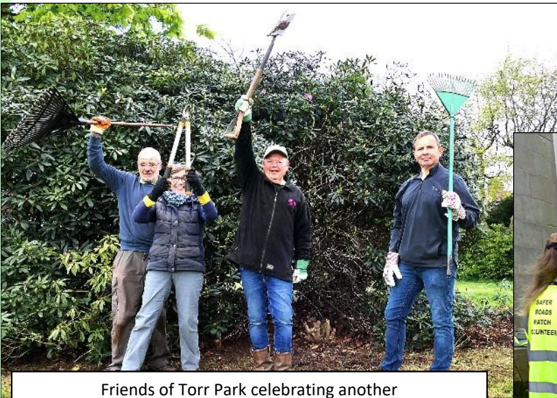
Friends of Torr Park celebrating another day beating the bindweed and other Park invaders.

Conservation Areas are playing an increasingly prominent role in Wirral's visitor attraction offer, but to maintain them properly, there must be an active two-way partnership between the Council and those who love Wirral and its historic areas. Making this work is a challenge for all parties but with good will on both sides, we can all play our part.