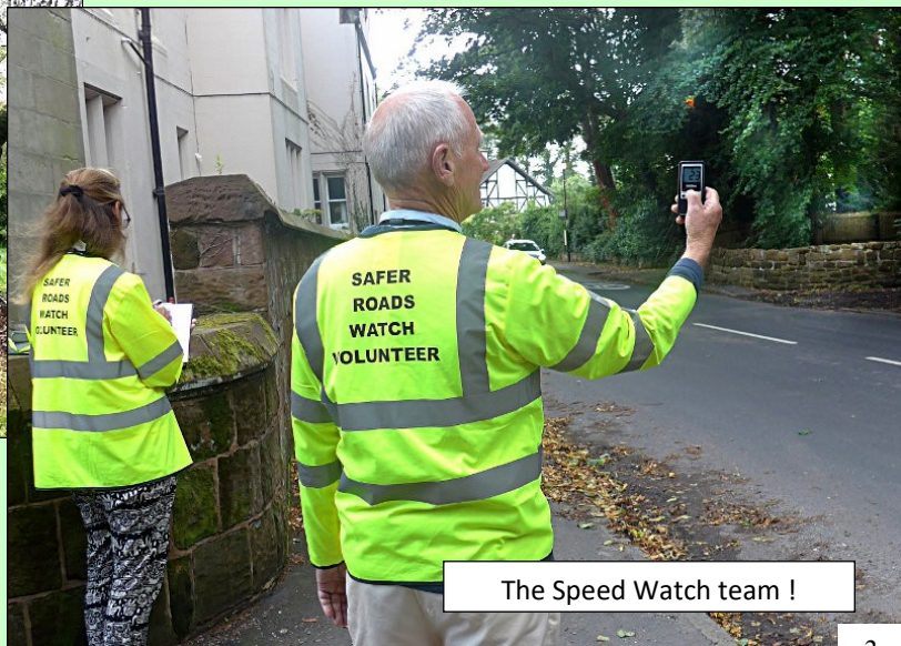
The Speed Watch team !